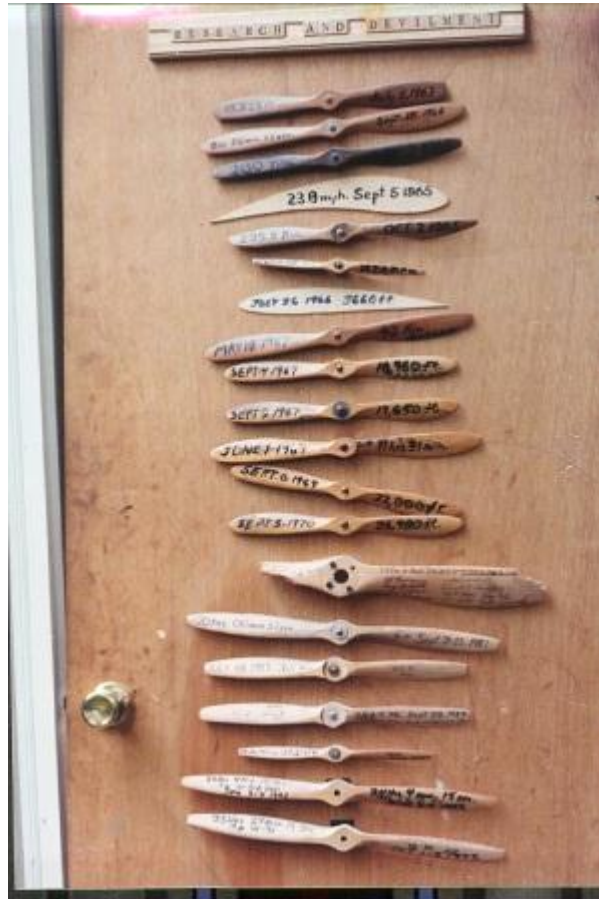
2008: The entrance door to Maynard Hill's workshop.

This PDF is property of the Academy of Model Aeronautics. Permission must be granted by the AMA History Program for any reprint or duplication for public use.