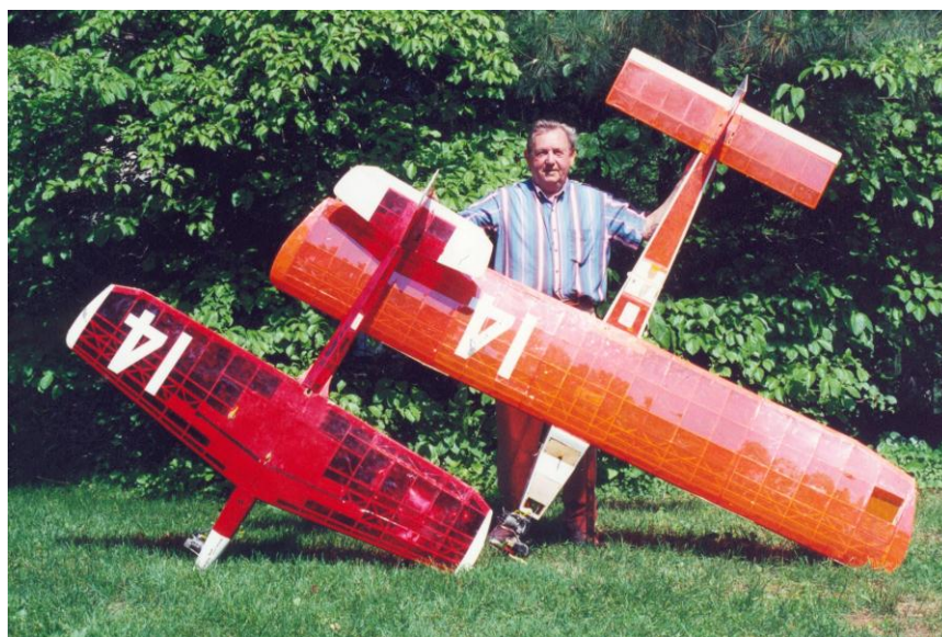
Maynard with two models that set four records. The Marvelous Martha, on the left, set 1250 km in closed course distance on June 26, 1995, and 457 miles in cross-country distance on August 29, 1995. On the right is Old Faithful, which set a duration record of 24 hours and four minutes on June 1 and 2, 1992, and a 33 hour, 39 minutes duration record on October 3, 4 and 5, 1992.

This lengthy article discusses a duration world records of 8 hours and 52 minutes set on September 18, 1964. Trade-offs about diesels, glow and spark ignition are explained. Tank systems, special glow plugs, fuel consumption measurements, reason for five failures and description of successful flights are included.