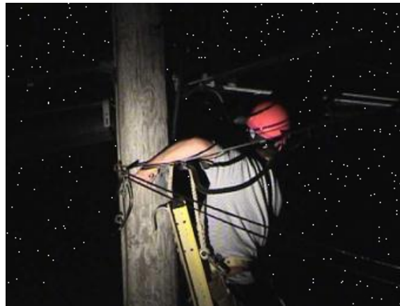
Problems with our cable internet connection.