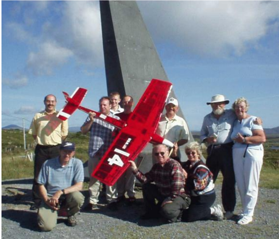
Irish TAM crew, with TAM-5 in hand, in front of the Alcock and Brown monument.