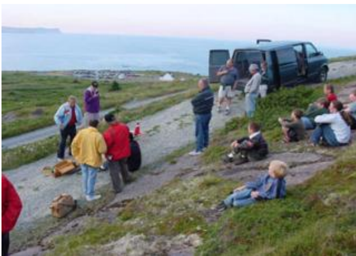
Crowd at Cape Spear.