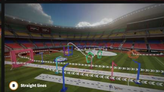
B Straight lines