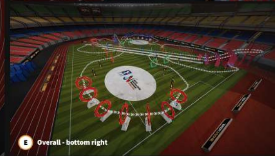
E Overall - bottom right