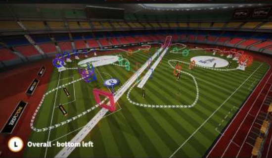
L Overall - bottom left