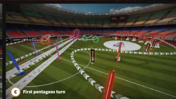
C First pentagons turn