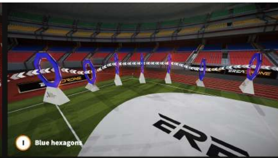
I Blue hexagons