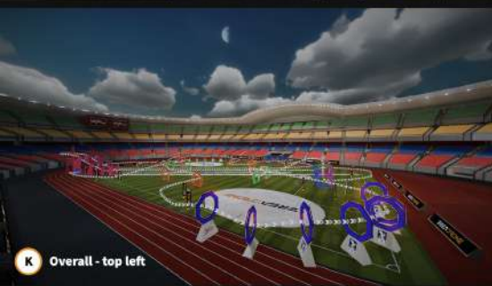
K Overall - top left