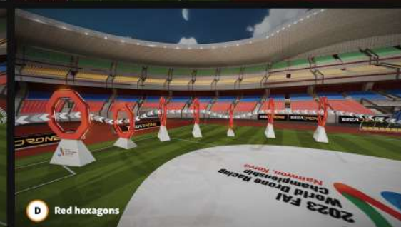
D Red hexagons