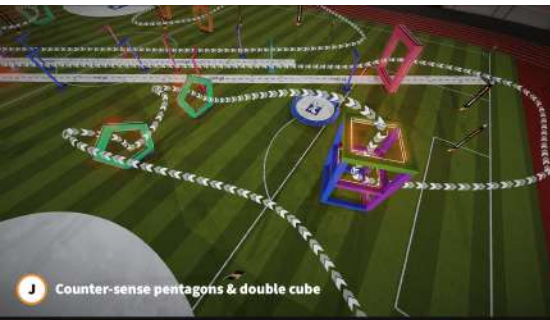
J Counter-sense pentagons & double cube