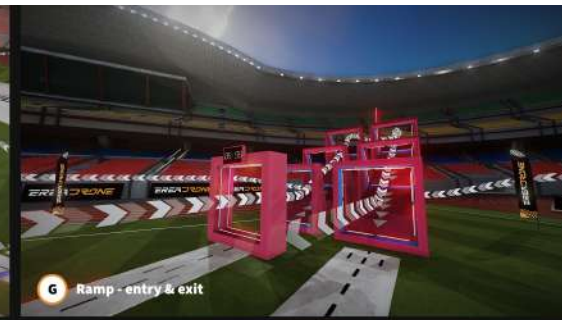
G Ramp - entry & exit